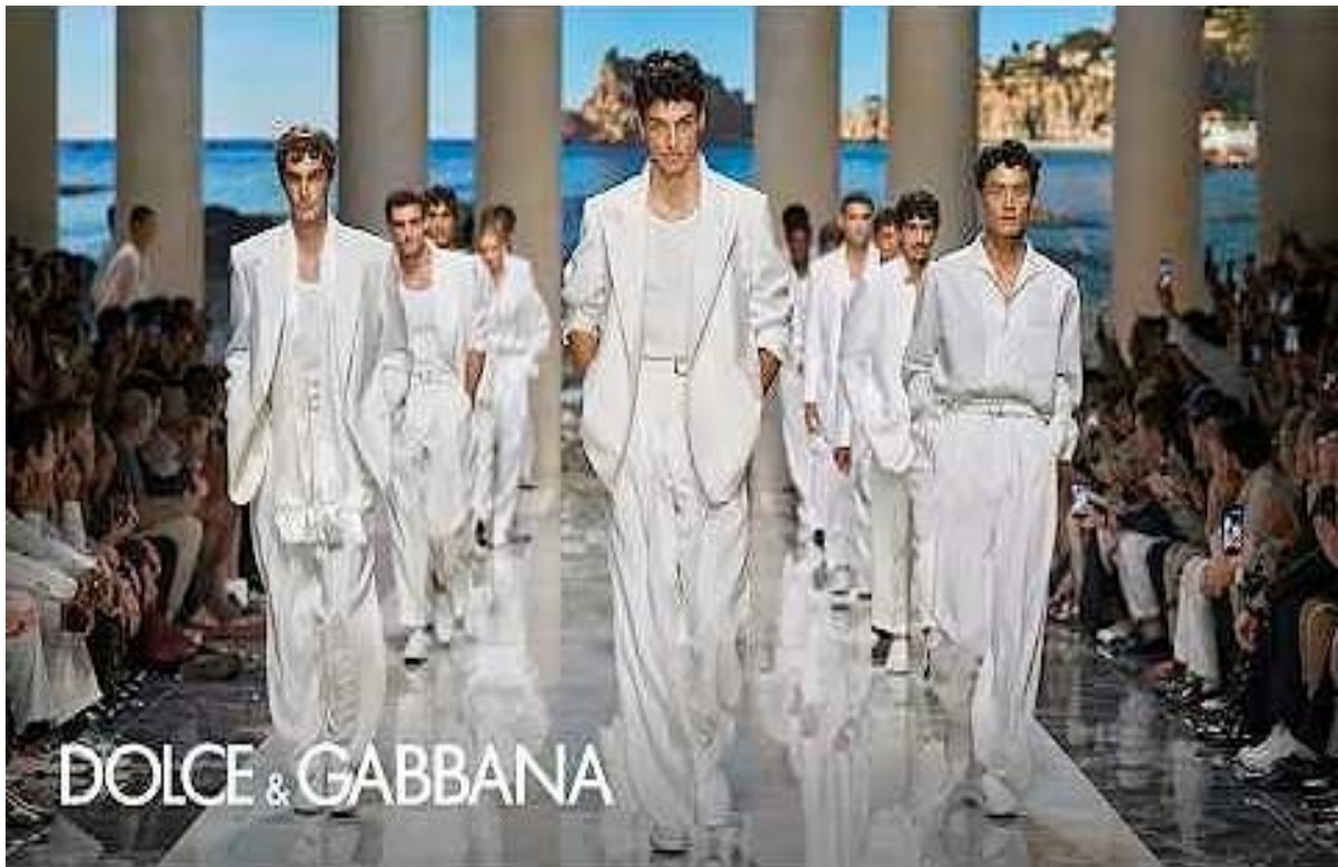
Dolce & Gabbana | Fall/Winter 2026/27 | Milan Fashion Week - 4K